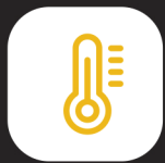
-30 : 60